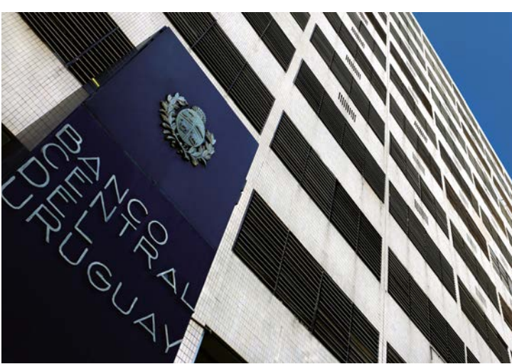
Central Bank of Uruguay. www.bcu.gub.uy

"The Uruguayan financial system has a great international reputation, evaluated from different perspectives in terms of strength, stability, solvency and its methodology for preventing money laun-